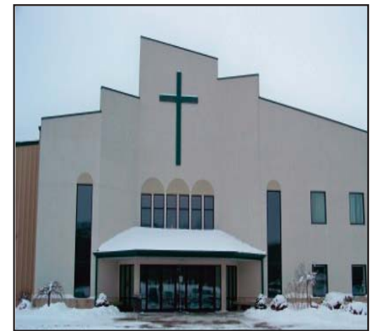
Heartland Retreat Center, Marengo, Ohio