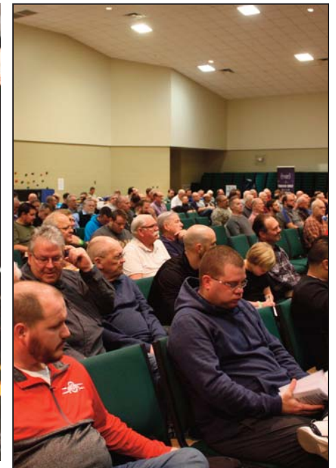
The Men in the Worship Service