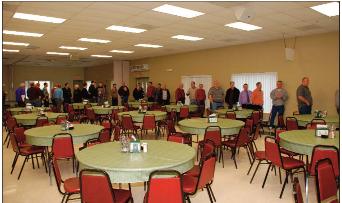
The men preparing to eat!