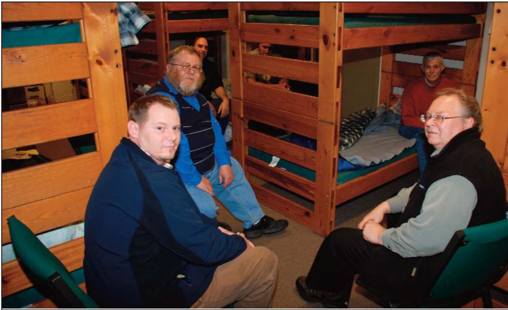
Individual Services in the Rooms